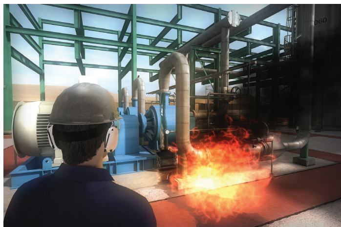
Emergency preparedness training in a VR environment