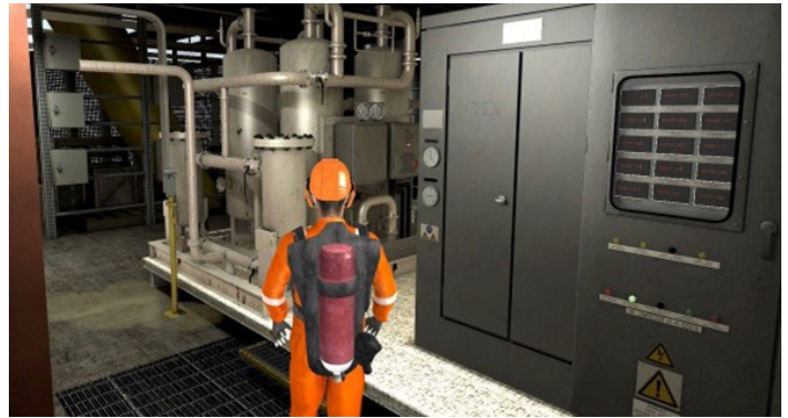
Training for offshore in the onshore VR training room

AVEVA Unified Learning transforms organizational performance and lowers total training costs.